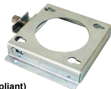
AFLWK-12 (VESA 75 Compliant)

Requires no cut out in the wall surface. It mounts directly on the existing wall or desk.